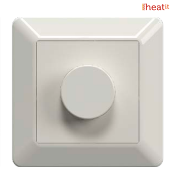
White RAL 9003